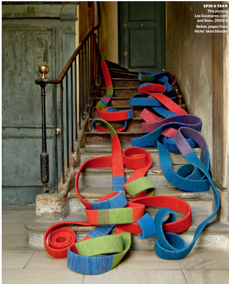
SPIN A YARN This picture, Les Escargots , cork and linen, 2003-4 Below, pages from Hicks' sketchbooks

Nearly half a century later, Hicks sits in a window seat at the New York restaurant SD26, where her work is integrated into the interior design: cord-wrapped fibres run along the walls of the bar, in the rear dining room, huge wobbly balls of yarn hang from the ceiling and walls. She pulls out a picture frame from her bag. Inside, her newly completed minime, Ta Fterá , is crowned with flame-coloured feathers that leave the bottom half of the warp exposed except for several lines of