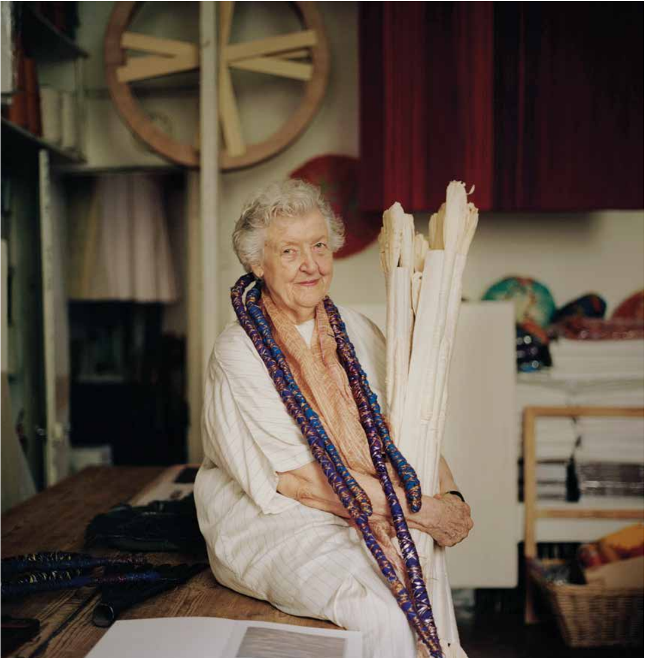
WEAVING HER MAGIC Sheila Hicks with several works in progress at her studio in Paris's 6th arrondissement.