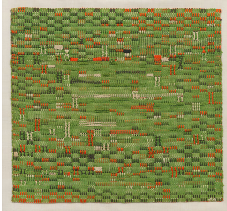
Anni Albers, "Pasture," 1958. Mercerized cotton.

She and her husband, Josef, loved the interlocking pattern known as the "meander," which appears not only in ancient Greece, but also in Navajo blankets and throughout the ancient cultures of Central and South America. Her "Red Meander," from 1969, inventively doubles the motif, resulting in a design that resembles a maze seen from above.