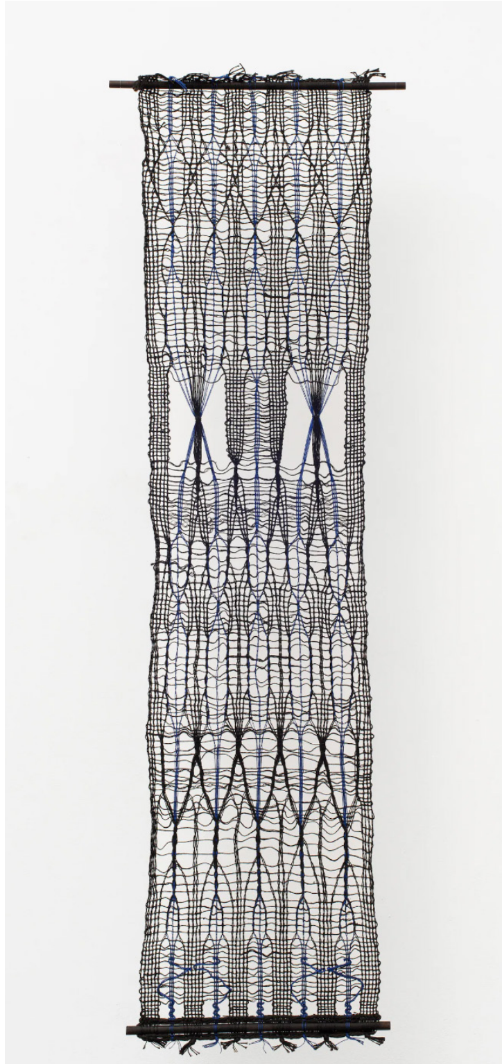
Lenore Tawney, "Vespers," 1961. Linen.