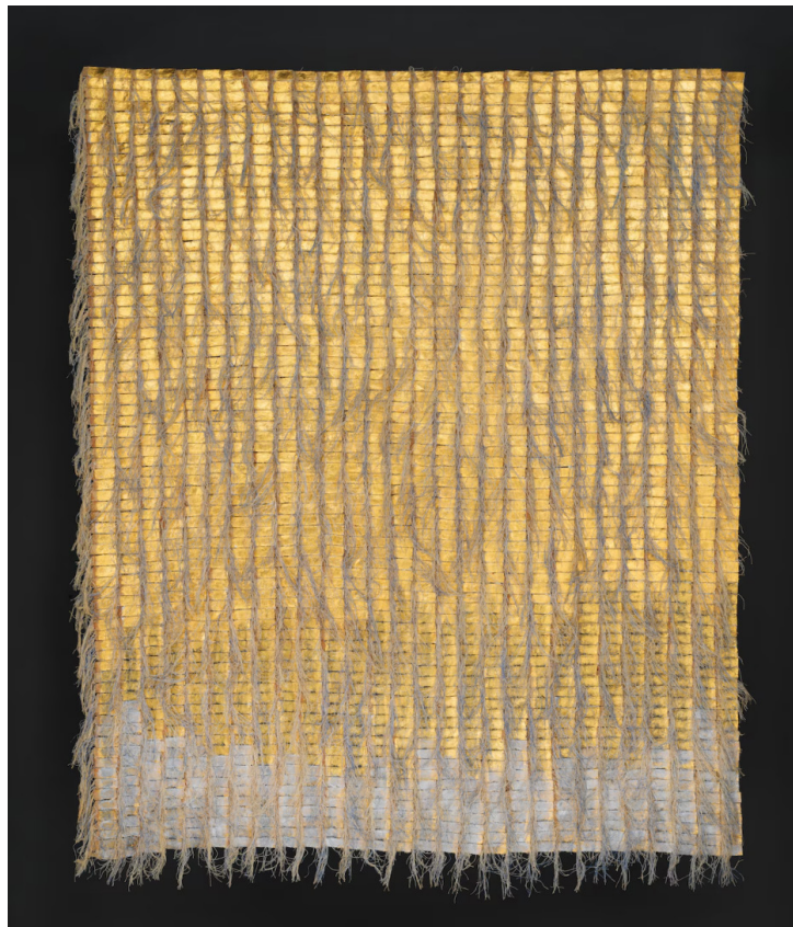
Olga de Amaral, "Alquimia 13" ("Alchemy 13"), 1984. Linen, rice paper, gesso, indigo red and gold leaf. (Peter Zeray/Olga de Amaral/Metropolitan Museum of Art. Gift of Olga and Jim de Amaral, 1987)

This much I could see: Dad would roll the shuttle back and forth between the warp's separated threads. The shuttle deposited unspooling thread — the weft — and after each pass (left to right, then right to left) he hammered them together with two perfectly weighted bangs of a beater that hung from the frame above.