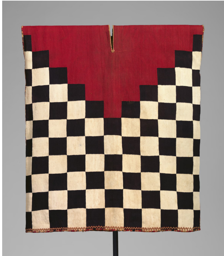
Inca artist, Tunic, 16th century, Argentina, Peru, or Bolivia. Camelid fiber.

llamas and vicuñas, macaw feathers, and cotton, and miraculously preserved by the dry Andean air — all attest to a sophisticated array of weaving techniques, iconography and abstract design.