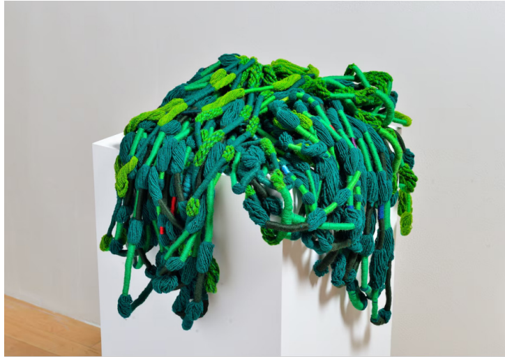
Sheila Hicks, "Peluca Verde," 1960-1961. Wool.

Paul Klee, who had been with Albers at the Bauhaus, liked to talk about the pleasures of "taking a line for a walk." You can see his influence in Hicks's "minimes," a term she invented for the small, roughly rectangular weavings she began making on her trip to South America. Intimate, amusing and gorgeously intuitive, the minimes are as fresh and idiosyncratic as Klee's paintings.