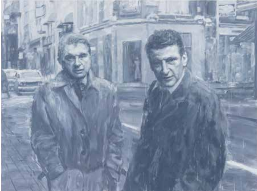
Yan Pei-Ming, Wanted in London , 2025, oil on canvas, 59 × 86 3/4".

entrance and smallest in a sequence of progressively larger paintings, it established both a physical and conceptual point of departure for what could appear to be a search. But the subsequent paintings, each based on an image of Bacon at a different stage of his life, taken from a different angle, and installed without chronological order, troubled the idea of a linear reading. Together, the ten paintings multiplying Bacon's image appeared like shadows, not just tonally, but in their flickering instability. His appearance and expression shifted from canvas to canvas, at times confronting the viewer with a direct stare, at others averting his gaze; his head turned, tilted, lifted; his lips parted or sealed. But in all of the paintings he looks haunted, as if caught between presence and retreat, the ghostly effect of each image only amplified by repetition.