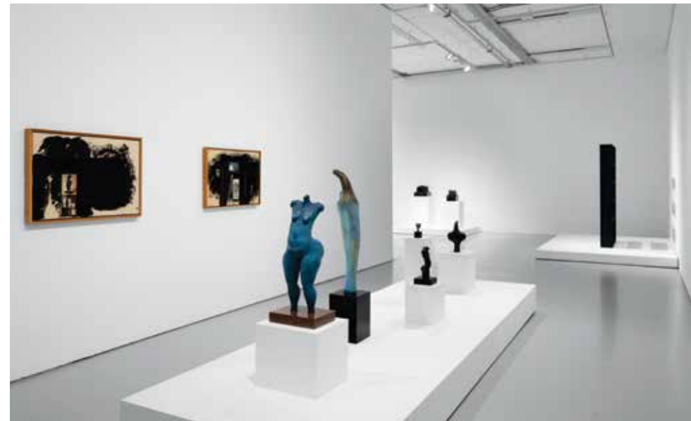
View of "Donald Locke: Resistant Forms," 2025.

As it was, Locke's technical mastery was evident throughout the show. Following its debut in Bristol, it is on view at the Ikon Gallery, Birmingham, through February 2026 and will later be staged at Camden Art Centre, London. The curators, led by Robert Leckie, presented more than eighty works spanning five decades and ranging from ceramics and black paintings to large-scale mixed-media compositions incorporating found photographs. Locke's early ceramics are particularly impressive. His "twin forms and biomorphic structures" from the 1960s through the '80s demonstrate exceptional technical command: significant hand-building skills to achieve contours and smooth transitions, precise moisture control and firing expertise to manage scale and avoid shrinkage, and knowledge of ceramic chemistry to render his signature jet-black color. The works were clinically displayed on white